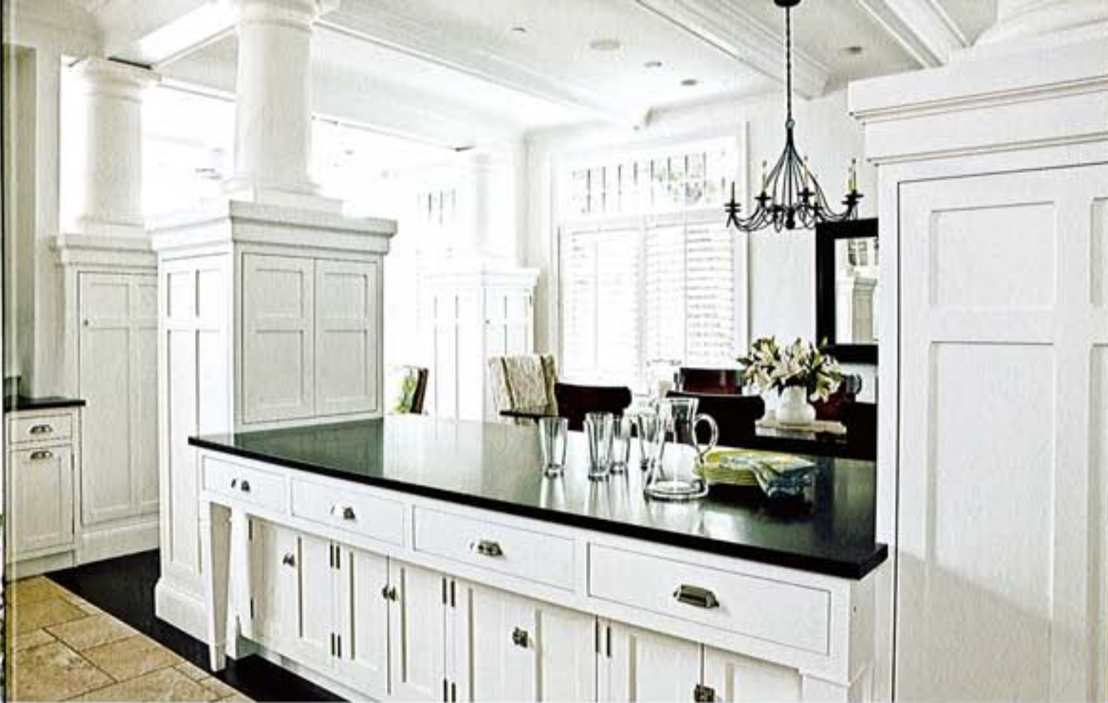
Above: The counter between the kitchen and dining area is where the Edwards children do homework and crafts. Below left: To minimize clutter in the kitchen, the microwave and a coffee machine for the coffee-loving Mike were built into a column. Below right: A relaxed dining area in lieu of a formal dining room is designed for family entertaining. Doors to the left of the open French doors conceal a computer workstation.