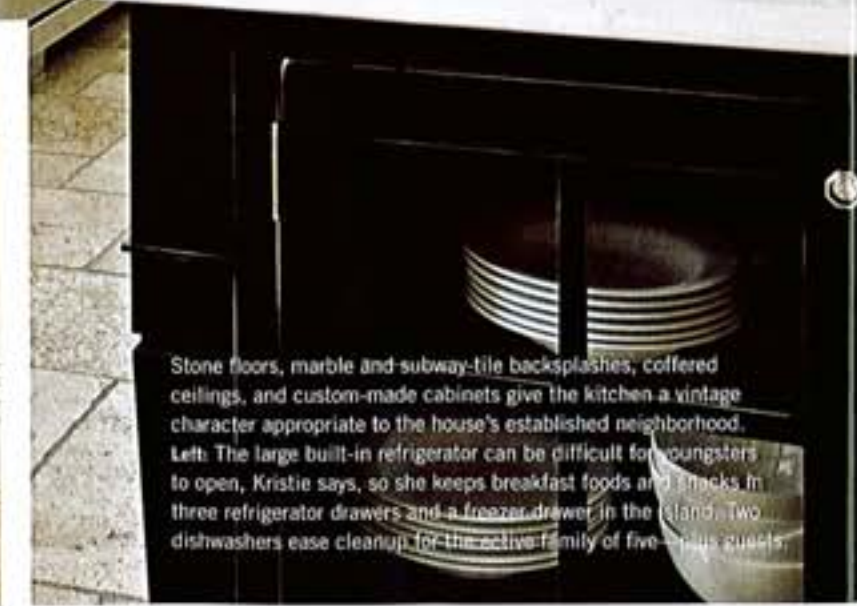
Stone floors, marble and subway-tile backsplashes, coffered ceilings, and custom-made cabinets give the kitchen a vintage character appropriate to the house's established neighborhood. Left: The large built-in refrigerator can be difficult for youngsters to open, Kristie says, so she keeps breakfast foods and snacks in three refrigerator drawers and a freezer drawer in the island. Two dishwashers ease cleanup for the active family of five—plus guests.