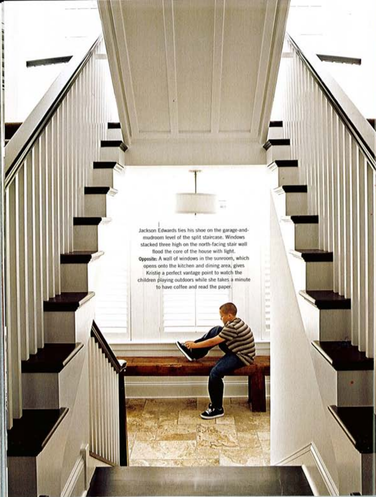
Jackson Edwards ties his shoe on the garage-and-mudroom level of the split staircase. Windows stacked three high on the north-facing stair wall flood the core of the house with light. Opposite: A wall of windows in the sunroom, which opens onto the kitchen and dining area, gives Kristie a perfect vantage point to watch the children playing outdoors while she takes a minute to have coffee and read the paper.