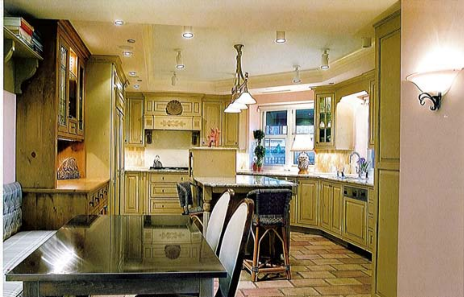
Each home in the 2120 building is totally unique and highly customized. This kitchen and adjoining family room shown to the right, open to the 2,000 square foot back terrace of this residence resulting in a very open and flowing floor plan. Photography © Curtis Ritchie/Tigerhill Studio.

The rooftop terrace actually spans the width of the building and wraps around the southern end, creating additional space for outdoor enjoyment. Located within the walls are enormous planters where large trees and shrubs have been planted. An integral irrigation system was installed under the unique paving system so that proper drainage takes place and watering the plants and trees is automatic. Photography © Curtis Ritchie/Tigerhill Studio.