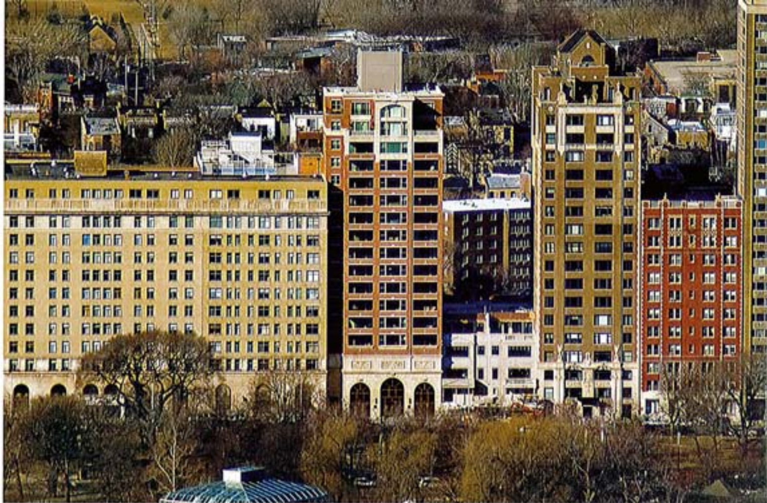
Above: The 2120 North Lincoln Park West condominium exudes quality and architectural style, which explains its tremendous appeal. The Baker Development team devoted a great deal of time to planning and design of the masterpiece. They were inspired by the turn of the century architecture for which Chicago is famous, Burnham, Sullivan and Wright.