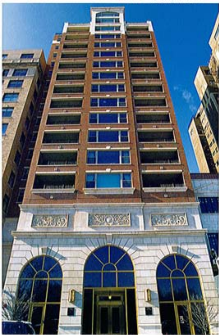
Left: Exterior bronze doors and intricate stone detail underscore the luxury of this Crystal Key Award winning building.

tional planning time spent early on will invariably yield a more efficient design, a shorter and smoother construction period and fewer change orders as well.