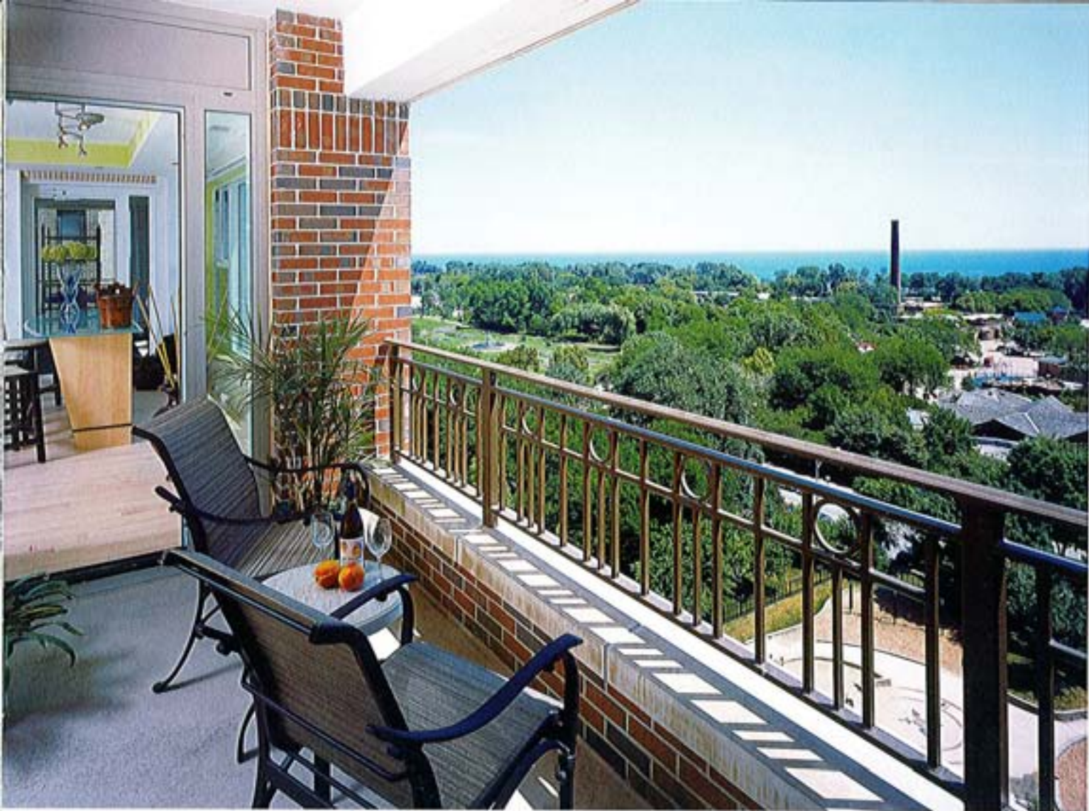
Above: Lincoln Park, Lake Michigan and the City of Chicago become part of each residence in the 2120 building.