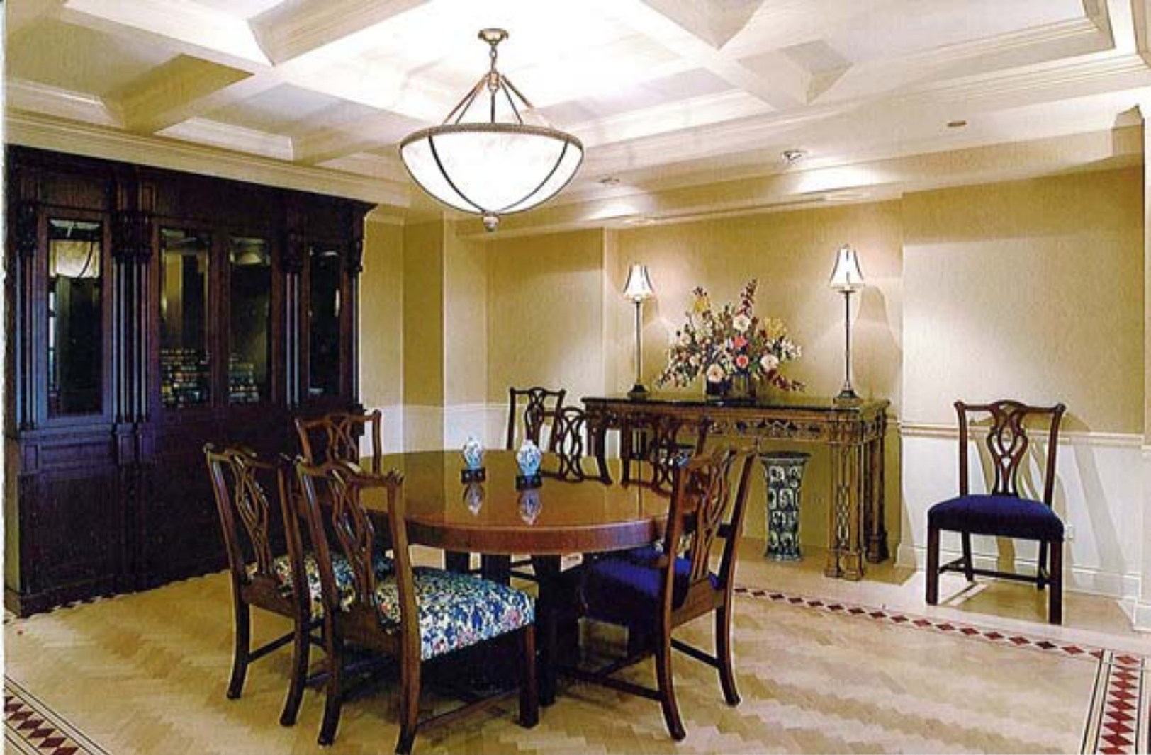
The intricate coffered ceiling and the herringbone floor with three species of wood used in the inlay design complement each other in this exquisite dining room.

verting some of them to condominiums. Soon he took on new construction projects as well.